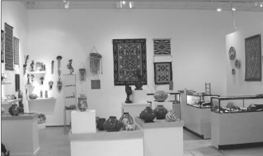
Native Arts Exhibition, Parks Exhibition Center