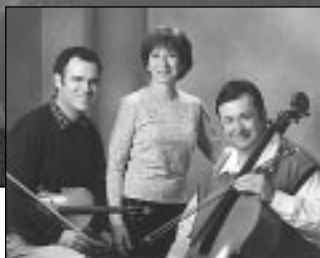
The Pacific Trio