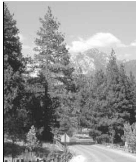
View of Tahquitz Peak from campus

Please read course descriptions carefully before enrolling