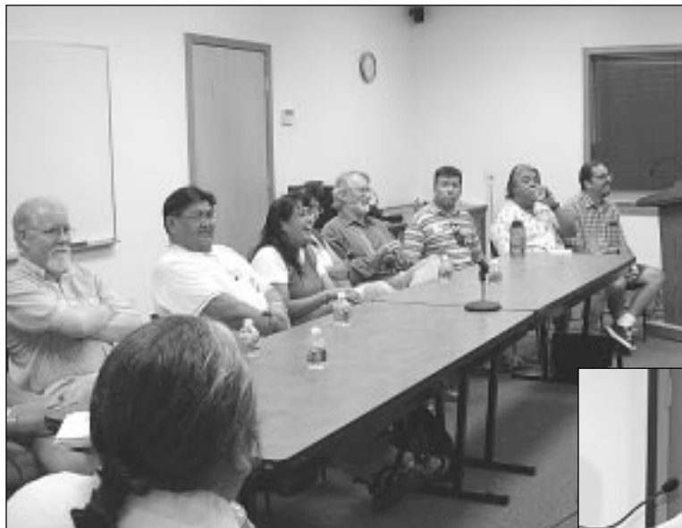
Panel of scholars and artists